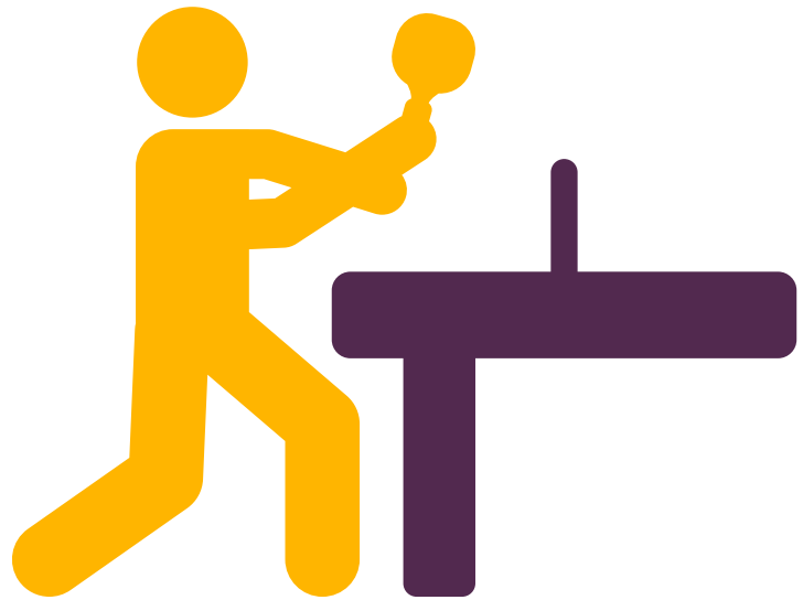
TABLE TENNIS OPEN TOURNAMENTS